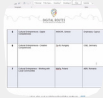
VIRTUAL MEETING 06.09.2021 | ONLINE