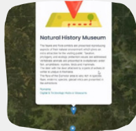
VIRTUAL MEETING 08.12.2021 | ONLINE