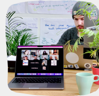
VIRTUAL MEETING 27.01.2022 | ONLINE